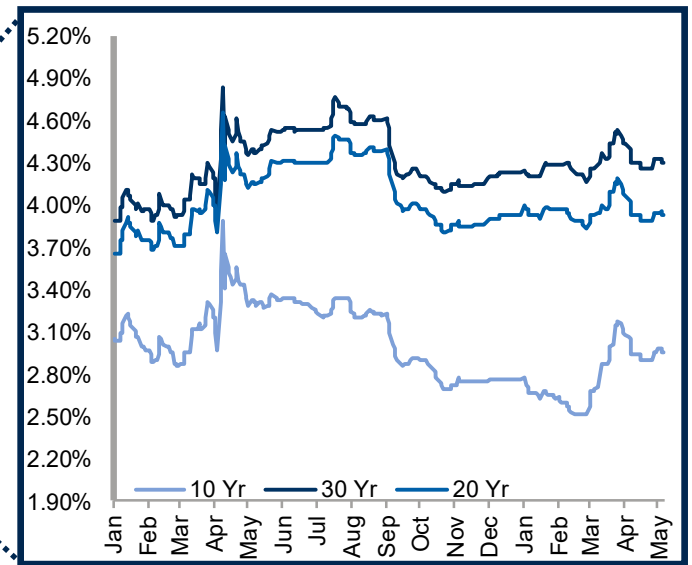
Shift in “AAA” MMD Since January 2025